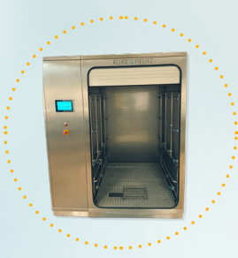
Ideal for washing wheelchairs, hoists, and other items such as walking frames.