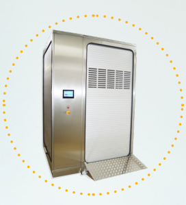
Designed to wash and disinfect foldable beds. and larger pieces of equipment.