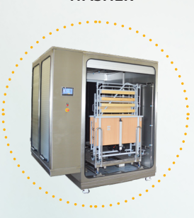
Developed to wash and disinfect beds. Ideal for those with a high level of throughput.